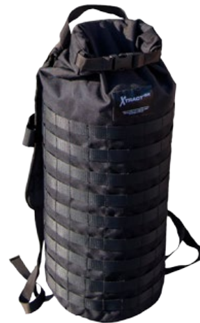
XTRACT® SR COMPLETE SYSTEM DIMENSIONS AND WEIGHT Packed: 56 x 26 cm, Weight: 4.5 kg Xtract SR Opened: 96 x 208 cm Max. Carrying Load: 300 kg

The XTract® SR "Complete" System comes in a carrying bag which includes the XTract® SR stretcher with a sled base for drag extractions and straps for lifting, dragging or hands-free carrying. An "Element Protection System" (EPS) is available as a separate item that can be used as a cover over the casualty for added warmth and water protection.