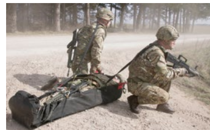
XTRACT® SR Complete System