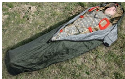
EPS - Weight: 400 g